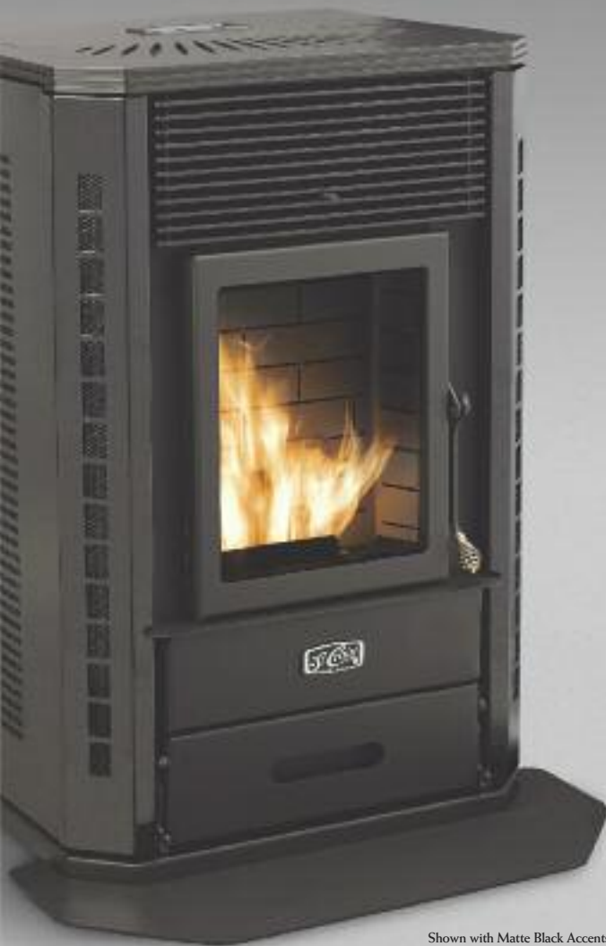
Shown with Matte Black Accents