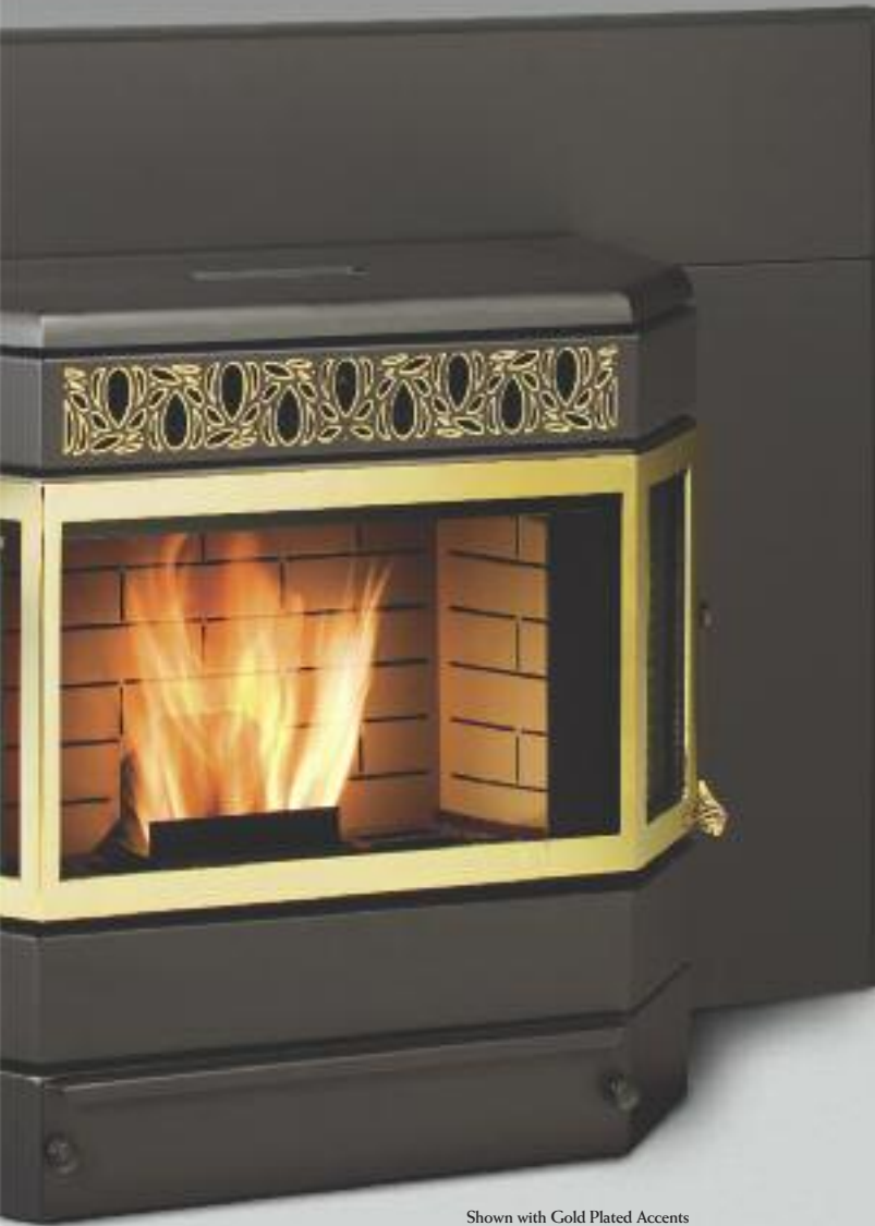
Shown with Gold Plated Accents