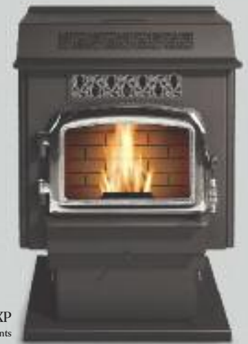
PRESCOTT EXP Shown with Nickel Plated Accents