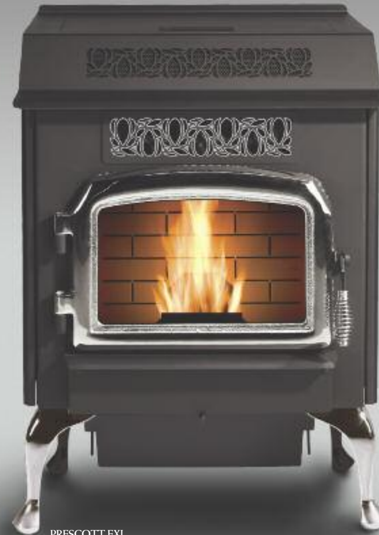
PRESCOTT EXL Shown with Nickel Plated Accents