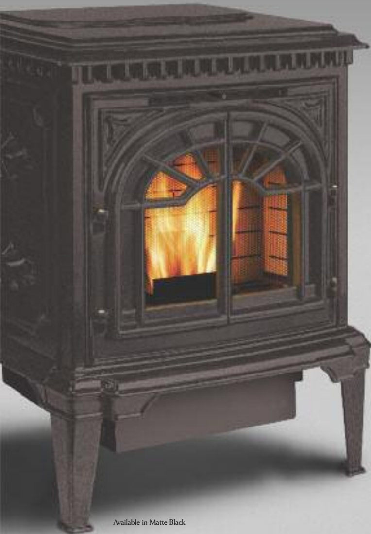
Available in Matte Black

The sturdy design of the cast iron Hastings stove embodies St. Croix style. Evoking the feeling of an old-fashioned woodburning stove, the Hastings melds thoughtful form and quality function. A strong frame is complemented by delicate design details—like arched doors that outline a large viewing area. The result? A quality stove that's as practical as it is attractive.