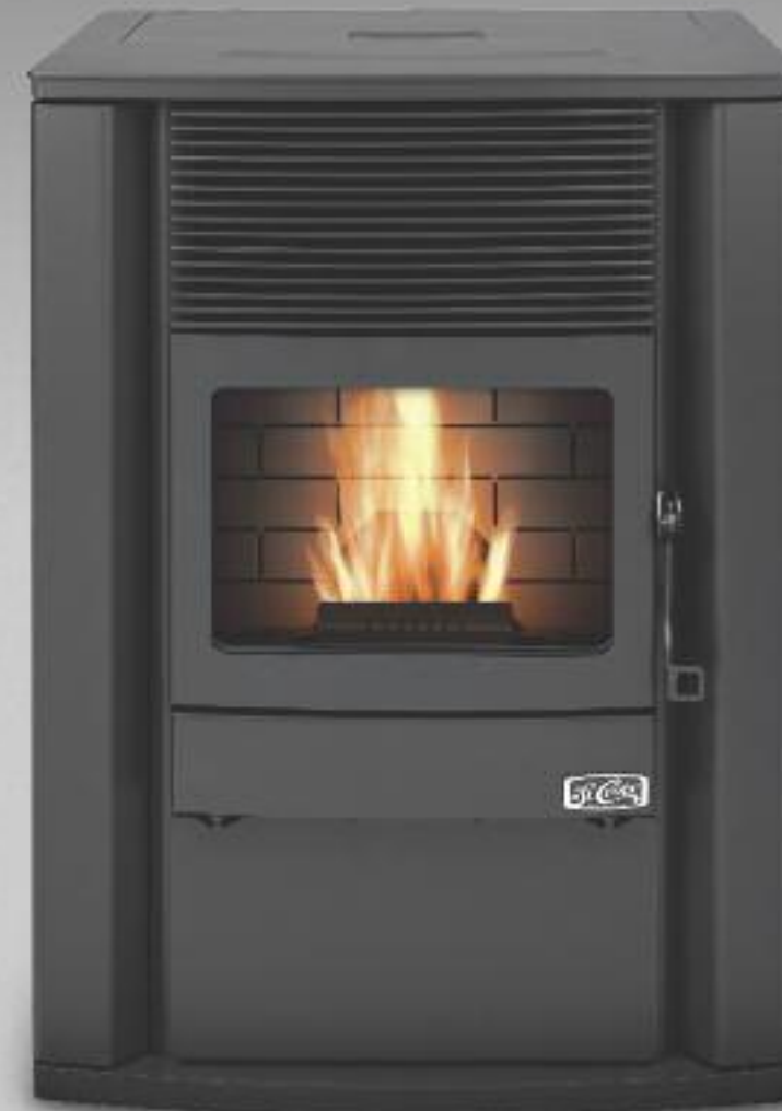
Shown with Matte Black Accents

ALSO AVAILABLE IN A MULTI-FUEL CAPABLE OPTION THAT BURNS CORN, WHEAT, RYE, CHERRY PITS AND DISTILLERS GRAIN PELLETS